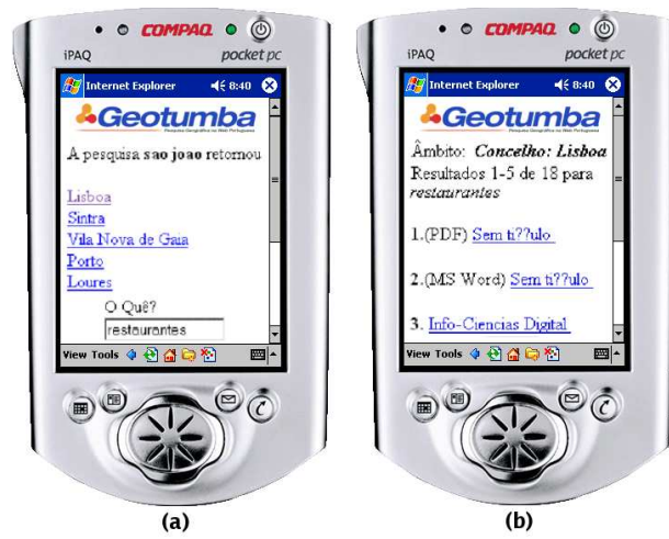
Figure 2. (a) Query disambiguation area. (b) Results presentation area.

the user submits the query and if the query has a geographic scope that has several matches in the GKB ontology, in this case we only present to the user the first five matches that have the greater population. This occurs in order to simplify the use of the prototype in small screen devices that only have a keyboard has input. The population is used has a disambiguation factor, because statistically its more likely that a user is looking for a place with a large population. After the query formulation and verification, the query is