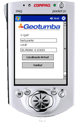
Figure 3. Application for automatically capturing geographic coordinates.

the user submits the query and if the query has a geographic scope that has several matches in the GKB ontology, in this case we only present to the user the first five matches that have the greater population. This occurs in order to simplify the use of the prototype in small screen devices that only have a keyboard has input. The population is used has a disambiguation factor, because statistically its more likely that a user is looking for a place with a large population. After the query formulation and verification, the query is